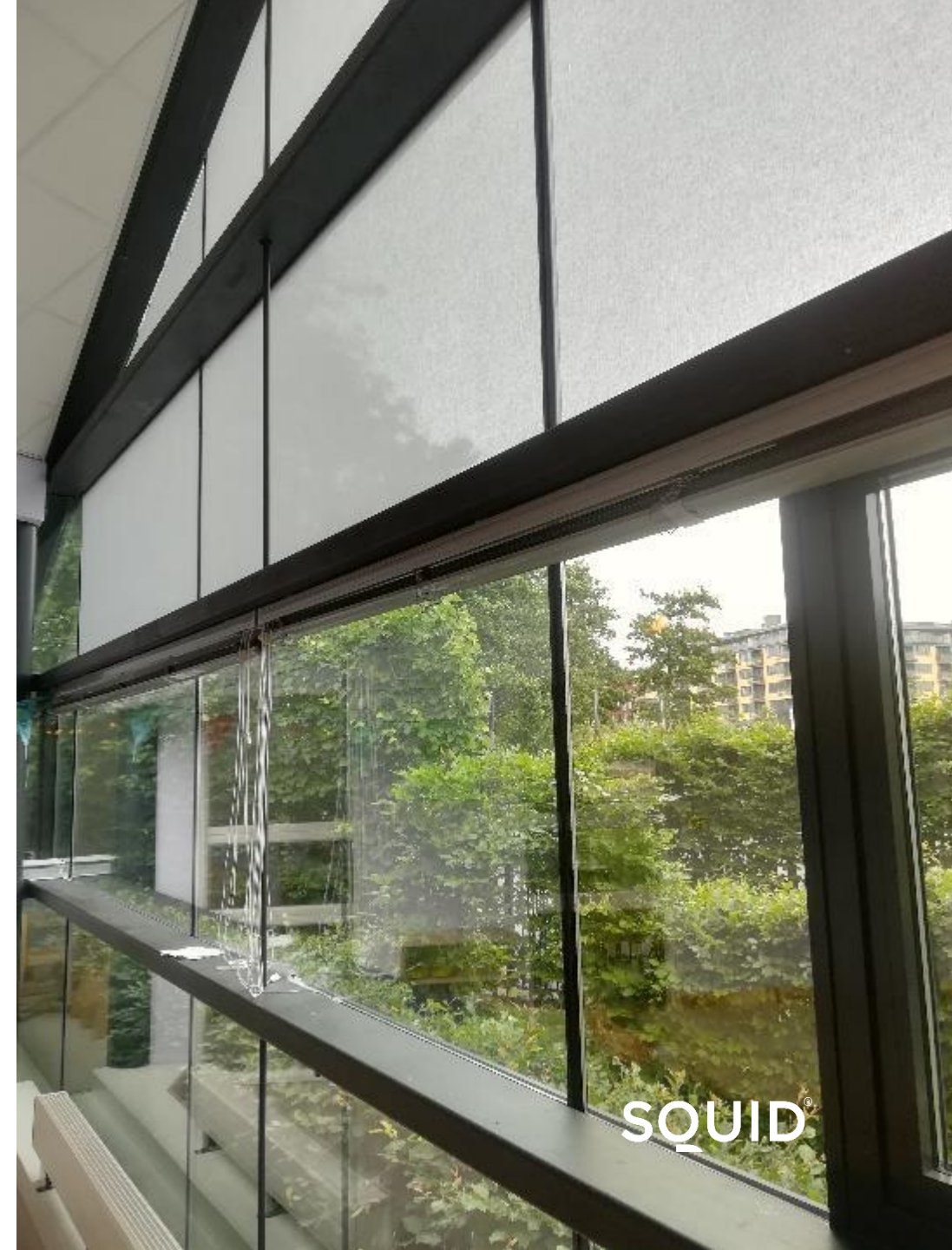
Children Day Care Center, Netherlands