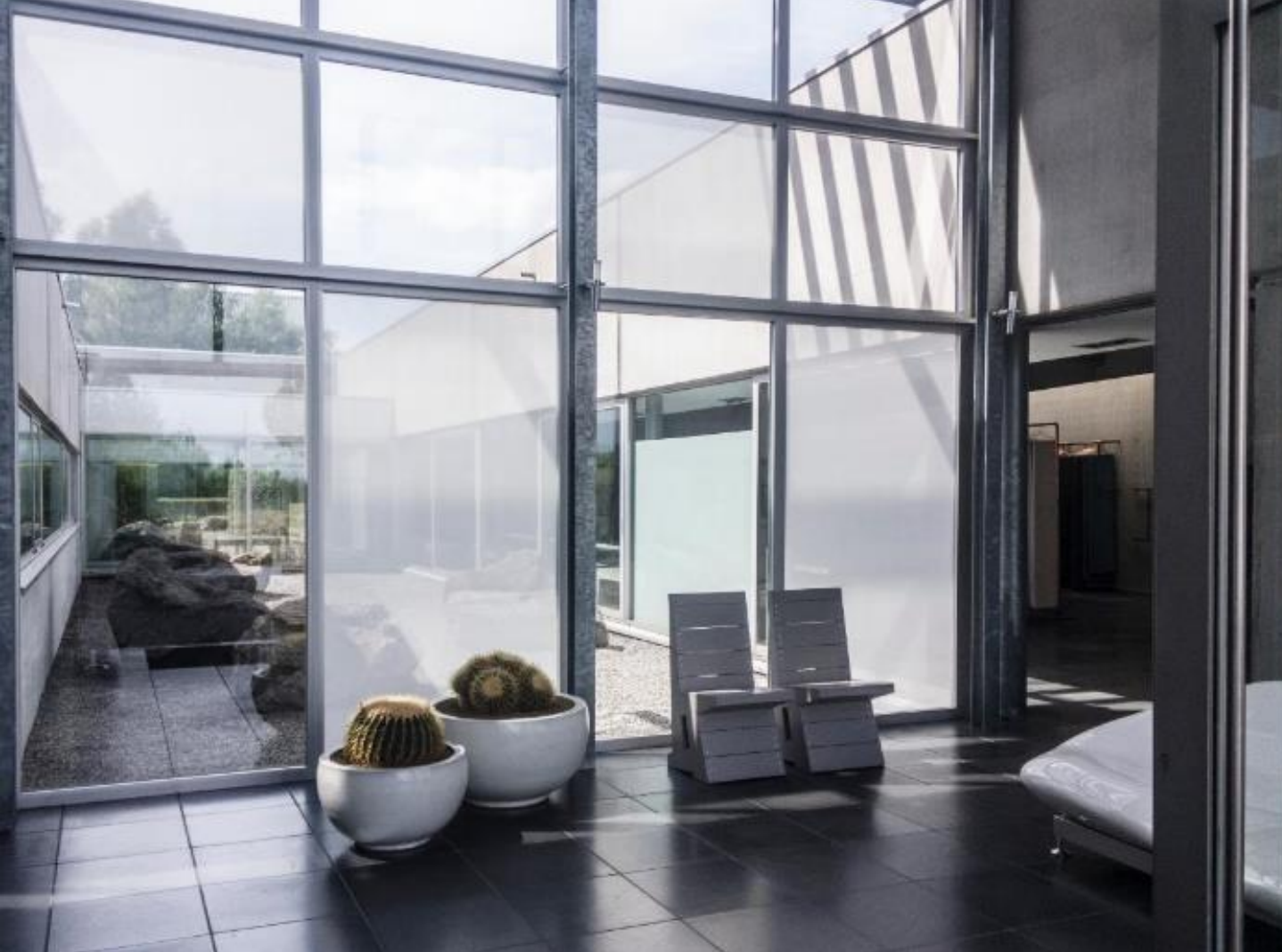
Company's Entrance Hall, Tielt, Belgium