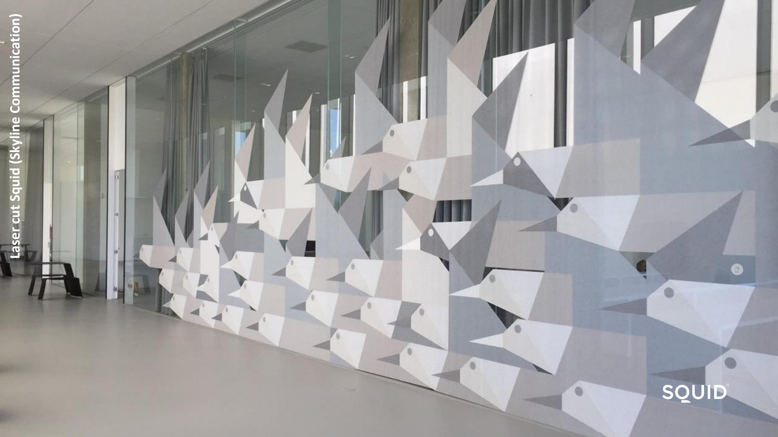
Laser cut Squid (Skyline Communication)