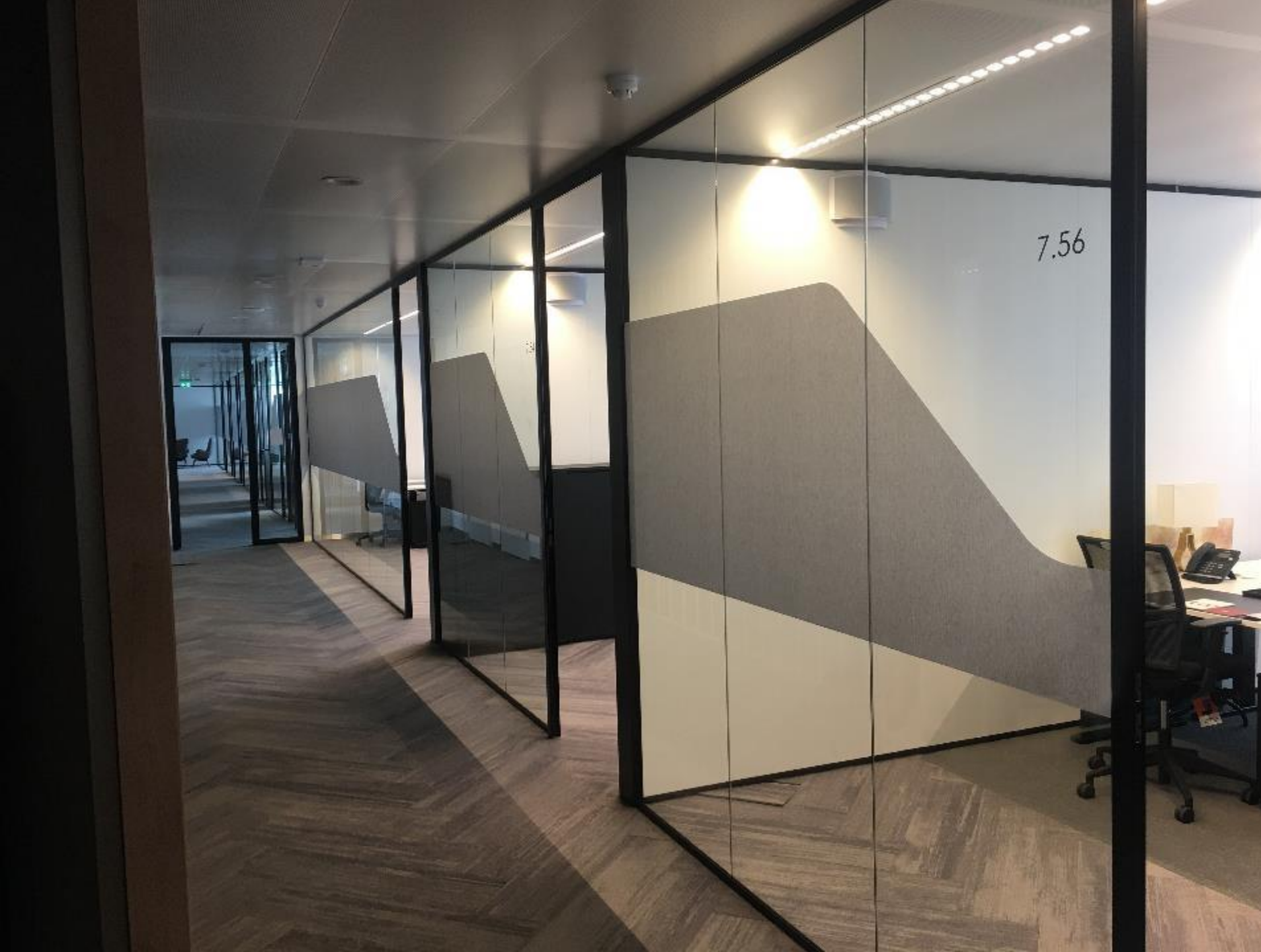
Office partitions, Netherlands