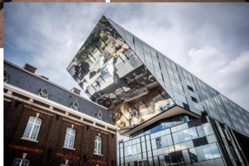
Partitions between public area and offices, New Townhall, Hasselt, Belgium