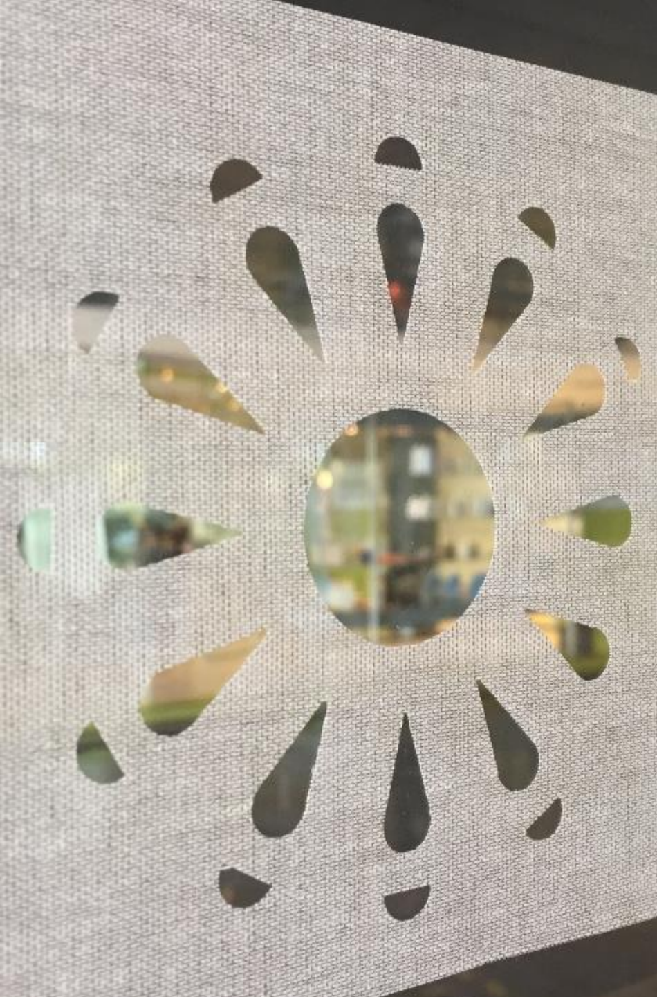
Squid cut on an Esko table cutter